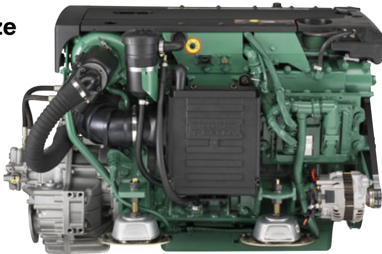
D4-260 with HS63AE reverse gear

The common rail injection system in combination with electronics and an advanced combustion system are setting new standards in minimizing noxious emissions and particles. The engine complies with the comprehensive emission requirements being introduced in Europe and the US in 2006.